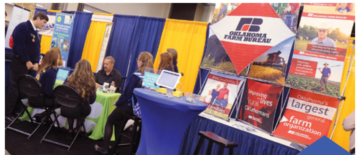
OKFB's Young Farmer & Ranchers committee hosted a booth for FFA members during the two-day convention. Students lined up for a free caricature drawing of themselves and enter to win prizes.